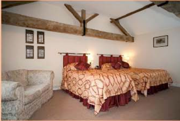
Double and single bed, sofa, kitchenette