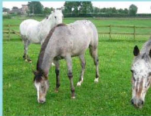
Bring the horses too!