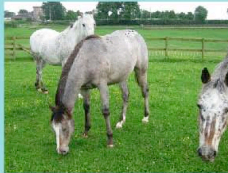
Bring the horses too!