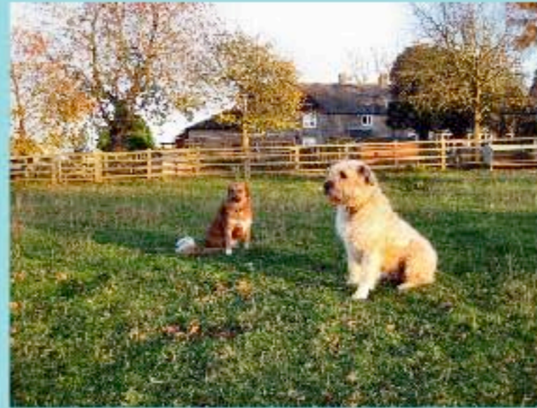
Dogs welcome by arrangement

Animal lovers will enjoy seeing the rare poultry and sheep, Appaloosa horses and Bouvier des Flandres dogs. There is also a small collection of vintage cars.