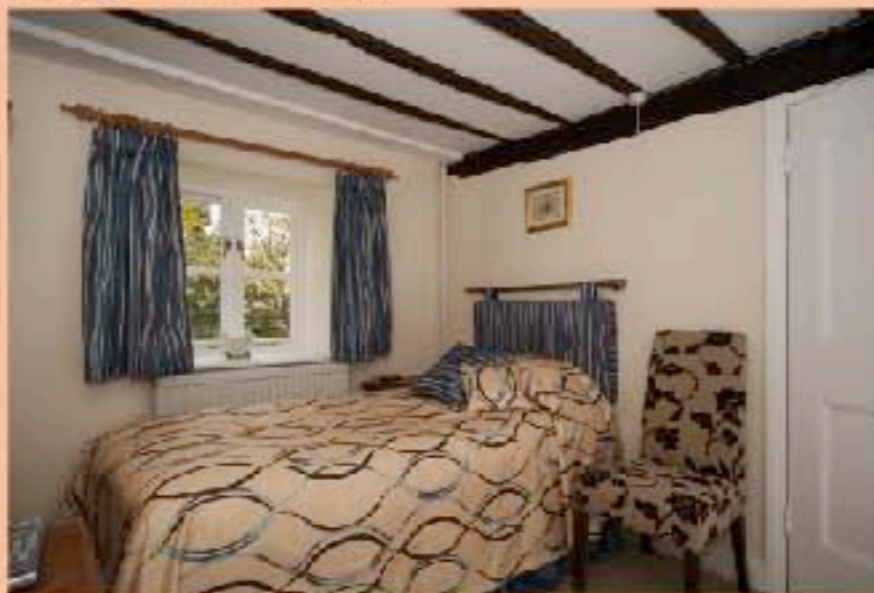
Ground floor in main house