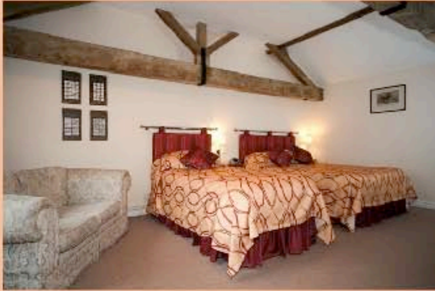
Double and single bed, sofa, kitchenette