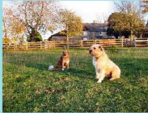
Dogs welcome by arrangement

Animal lovers will enjoy seeing the rare poultry and sheep, Appaloosa horses and Bouvier des Flandres dogs. There is also a small collection of vintage cars.