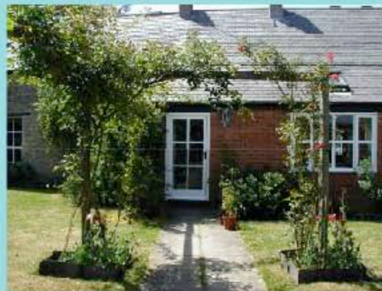
The Walled Garden