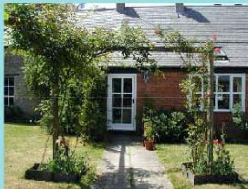
The Walled Garden