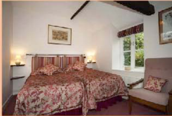
Two single beds, kitchenette, View over walled garden