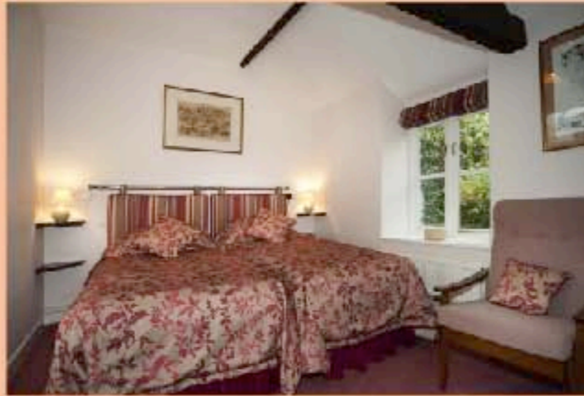
Two single beds, kitchenette, View over walled garden